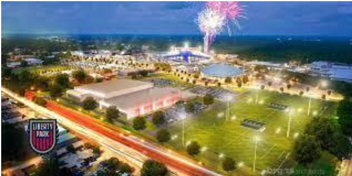
Liberty Park project update